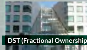
DST (Fractional Ownership)