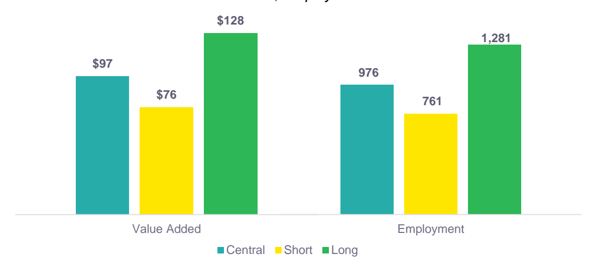
Figure 2. Sensitivity analysis: Estimated economic contribution by businesses that make use of like-kind exchange rules Dollars in billions, Employment in thousands

Note: All estimates are for economic activity in the United States and are relative to the US economy in 2021. Labor income is a component of value added. Figures are rounded.