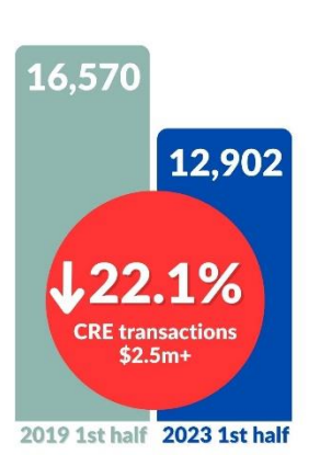
CRE $2.5m+ transactions

The 15% rise in the number of exchanges initiated, when commercial real estate transaction count fell by 22.1%, underscores the importance of like-kind exchanges in periods of reduced commercial real estate market activity.